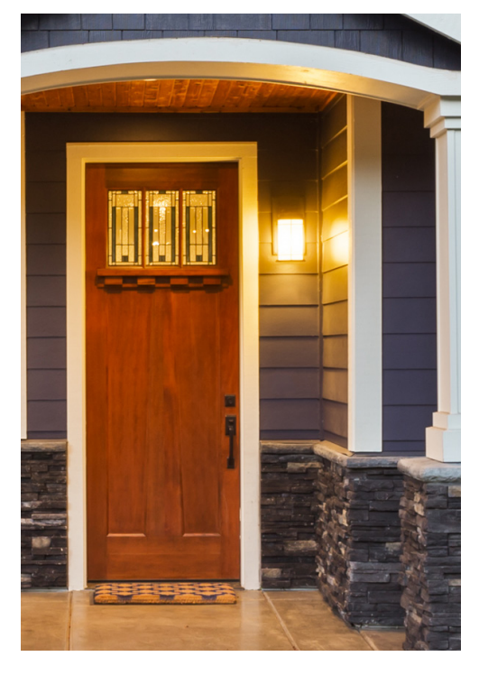
Suitable for home, street lamp, patio, porch, front door